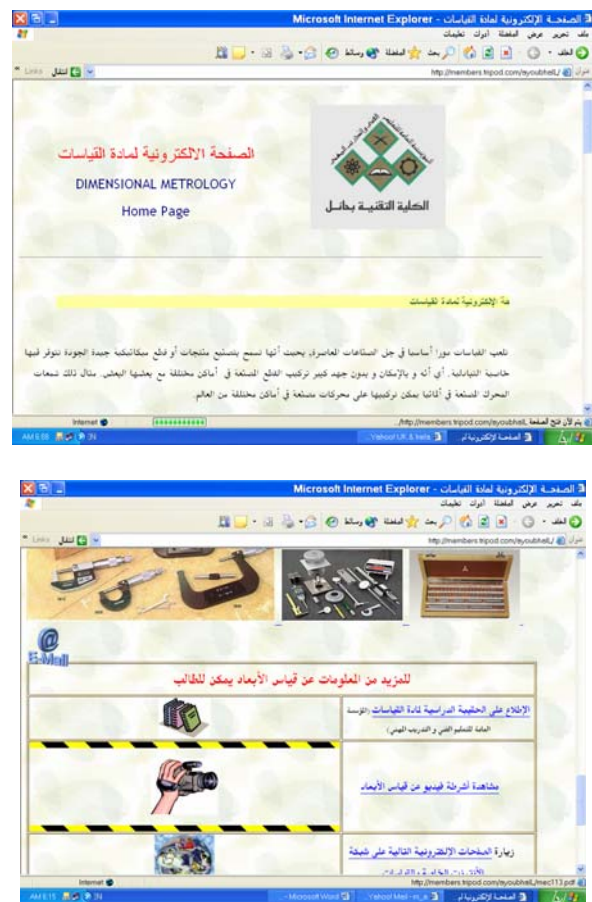
Figure 3 – The web-based Metrology and Quality Control course Home Page