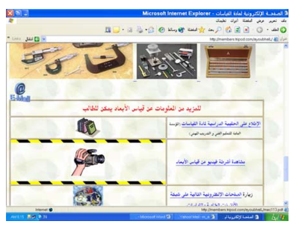
Figure 3 – The web-based Metrology and Quality Control course Home Page