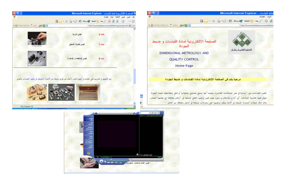
Figure 3 – The web-based Metrology and Quality Control course Home Page