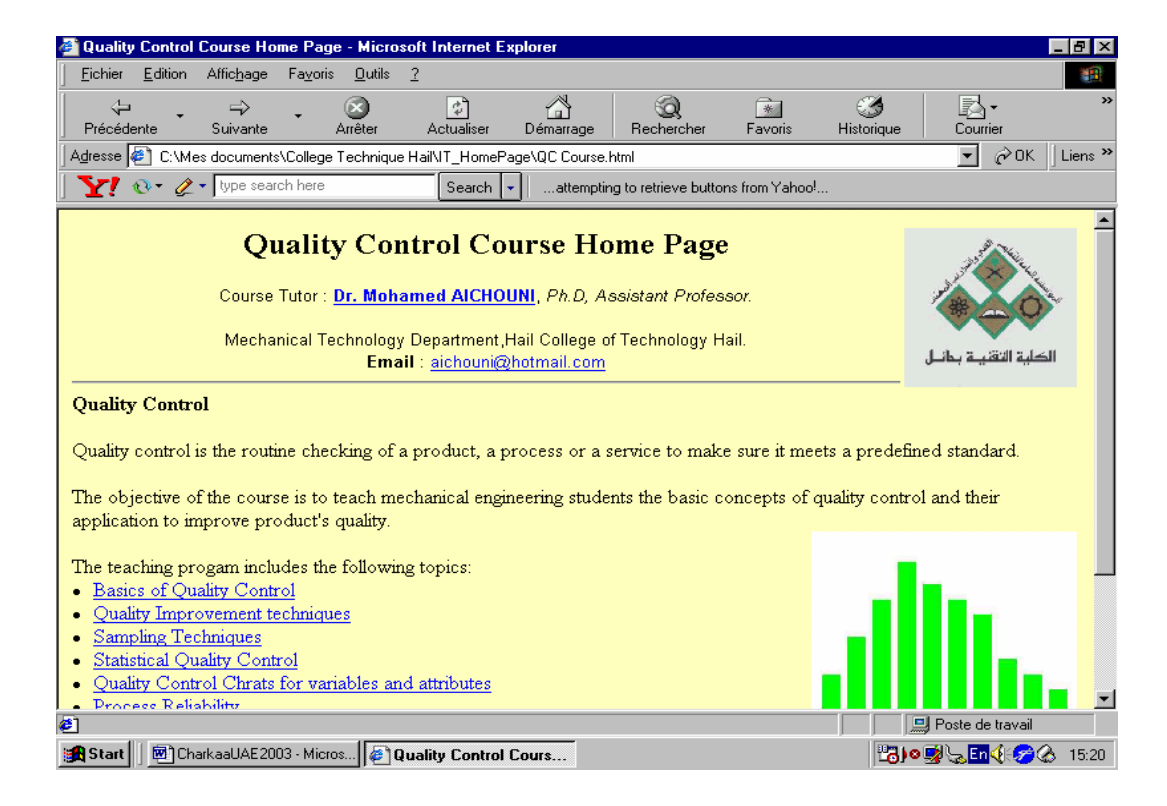
Figure 2 – The web-based Quality Control course home page